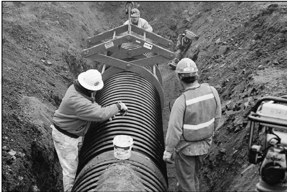
Figure 3-3: Use of a Gasketed Coupling for HDPE Sewer Pipeline Application

Although HDPE pipe products are versatile, the primary use of corrugated HDPE is for gravity flow water management. Examples of these water management systems include: