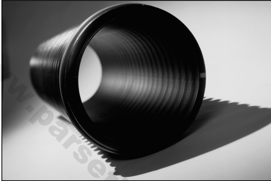
Figure 3-2: Type S HDPE Pipe with Corrugated Exterior and Smooth Interior

Pipe manufacturers provide various pipe joining methods depending on the pipe style and project requirements. Coupling bands, with or without a gasket, wrap around the pipe and are secured with plastic ties. Gasketed bell and spigot joints are also widely used. Nonrated and nonpressure tested watertight joints are suitable for the majority of nonpressure (gravity flow) drainage applications and typically do not experience significant leakage. For environmental and other reasons, most manufacturers also have a pressure-rated watertight joint suited for nonpressure applications. Joints are rated at either 10.8 psi or 5.0 psi when tested in accordance with ASTM D 3212.