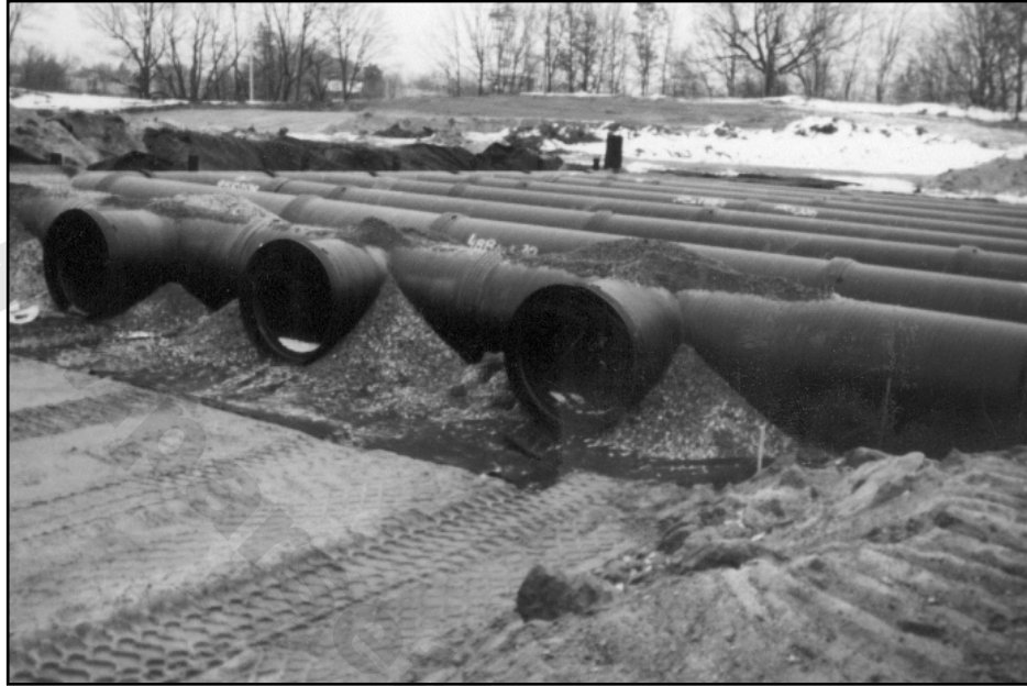
Figure 3-5: On-Site Storm Water Detention Facilities