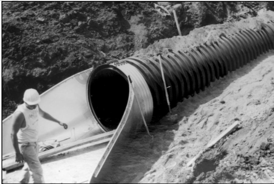
Figure 3-4: Highway Drainage Culvert with HDPE Flared End Section